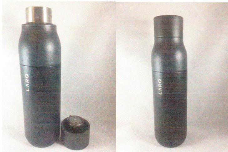
Figure 1: LARQ Bottle with cap on and off

LARQ provided 4 stainless steel bottles and one UV-C LED cap for the testing. LARQ provided Sterile Deionized water that was used to spike the samples and treat. E. coli (ATCC 25922) was used as the testing organism in this experiment with a starting solution of about 1.00 \times 10^7 CFU/mL. Testing was done in 3 replicates for 2-min tests, and 6 replicates for 1-min and 3-min tests. Inoculated volumes for each run was 500 mL, out of which 50 mL was collected for LARQ internal purposes, and 450 mL was tested in a stainless bottle with UV cap (provided by LARQ) for designated run-times. Pre and post treatment aliquots were plated in serial dilutions ranging from 10^{-1} to 10^{-9} on APC Media using a pour plate technique. Plates were incubated for 48-hr at 35°C.